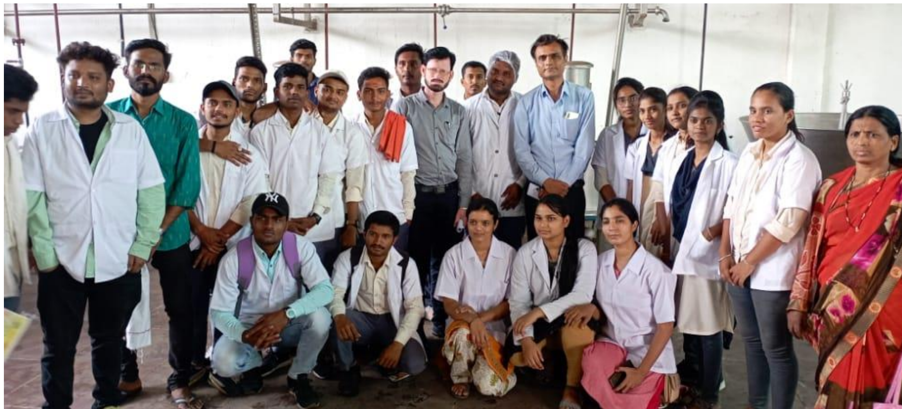
EUCATIONAL TOUR: EXPERIMENTAL DAIRY PLANT