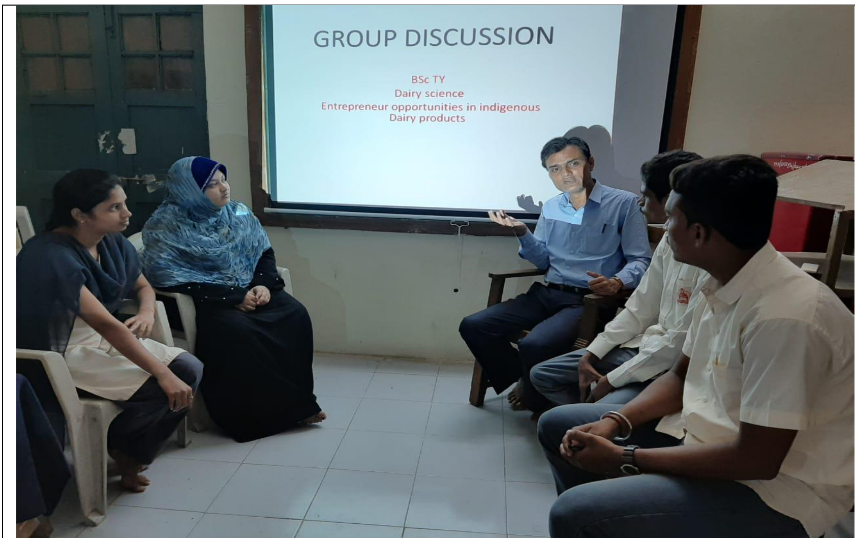
B.Sc. Third Year Dairy science students Group Discussion on Entrepreneur opportunities Indigenous Dairy Products, Date :19 / 09 / 2019