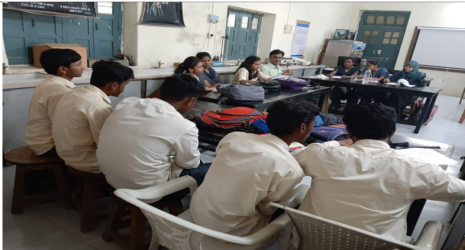
B.Sc. First Year Group Discussion topic - Factors affecting quality and quantity of Milk Date - 16/09/2019