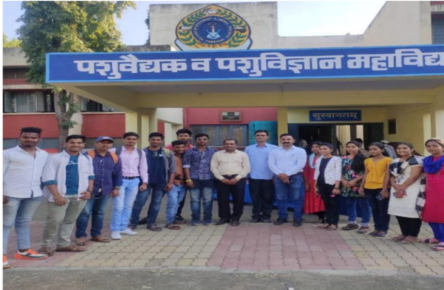
Visit to Marathwada Agricultural University, Parbhani