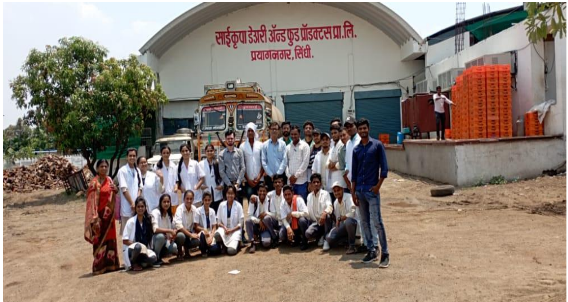
EUCATIONAL TOUR OF DAIRYING UG AND PG STUDENTS: 2022