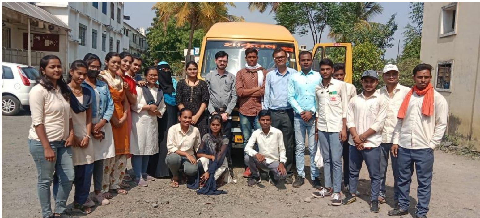
EUCATIONAL TOUR OF DAIRYING UG AND PG STUDENTS: 2022