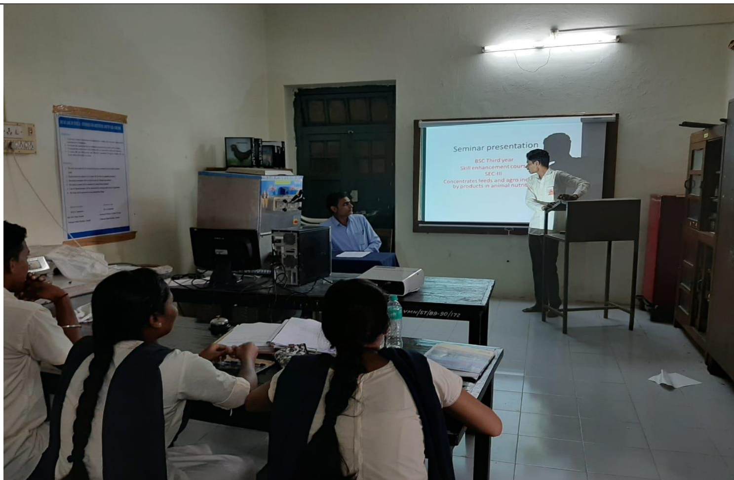
Seminar presented by B.Sc III Year Dairy science students on Skill Enhancement Course Date - 28/08/2019