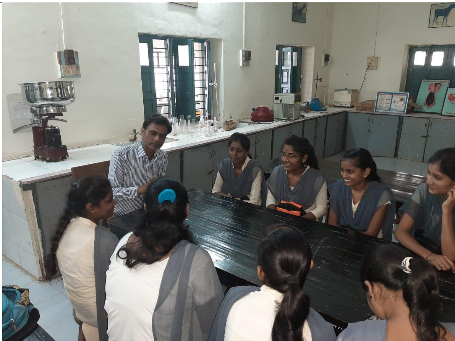
Group Discussion on Topic - Animal Genetic Recourses in Marathwada B.Sc. Second Year Dairy Science Students Date - 18/09/2019