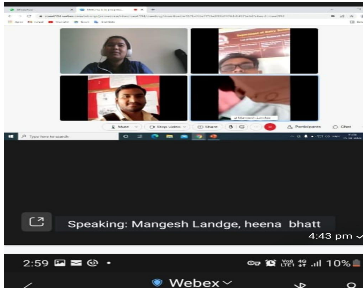
ORGANIZATION OF ONLINE SEMINARS ON WEBEX PLATFORM