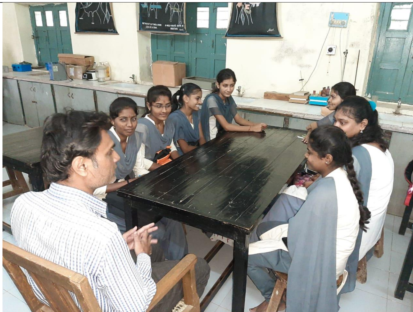
Group Discussion on topic - Animal Genetic Recourses in Marathwada B.Sc. Second Year Dairy science students Date - 18/09/2019