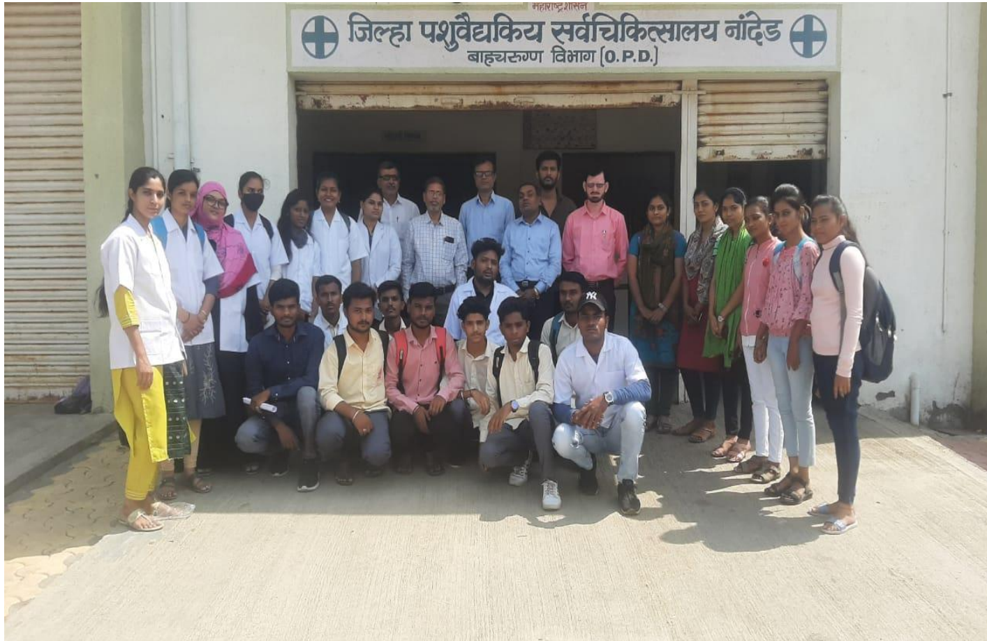
Visit to Government poly clinic vet. Hospital, AI center NANDED