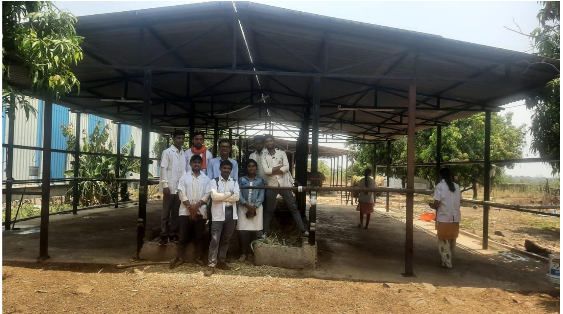
EDUCATIONAL TOUR OF DAIRYING UG AND PG STUDENTS: 2022