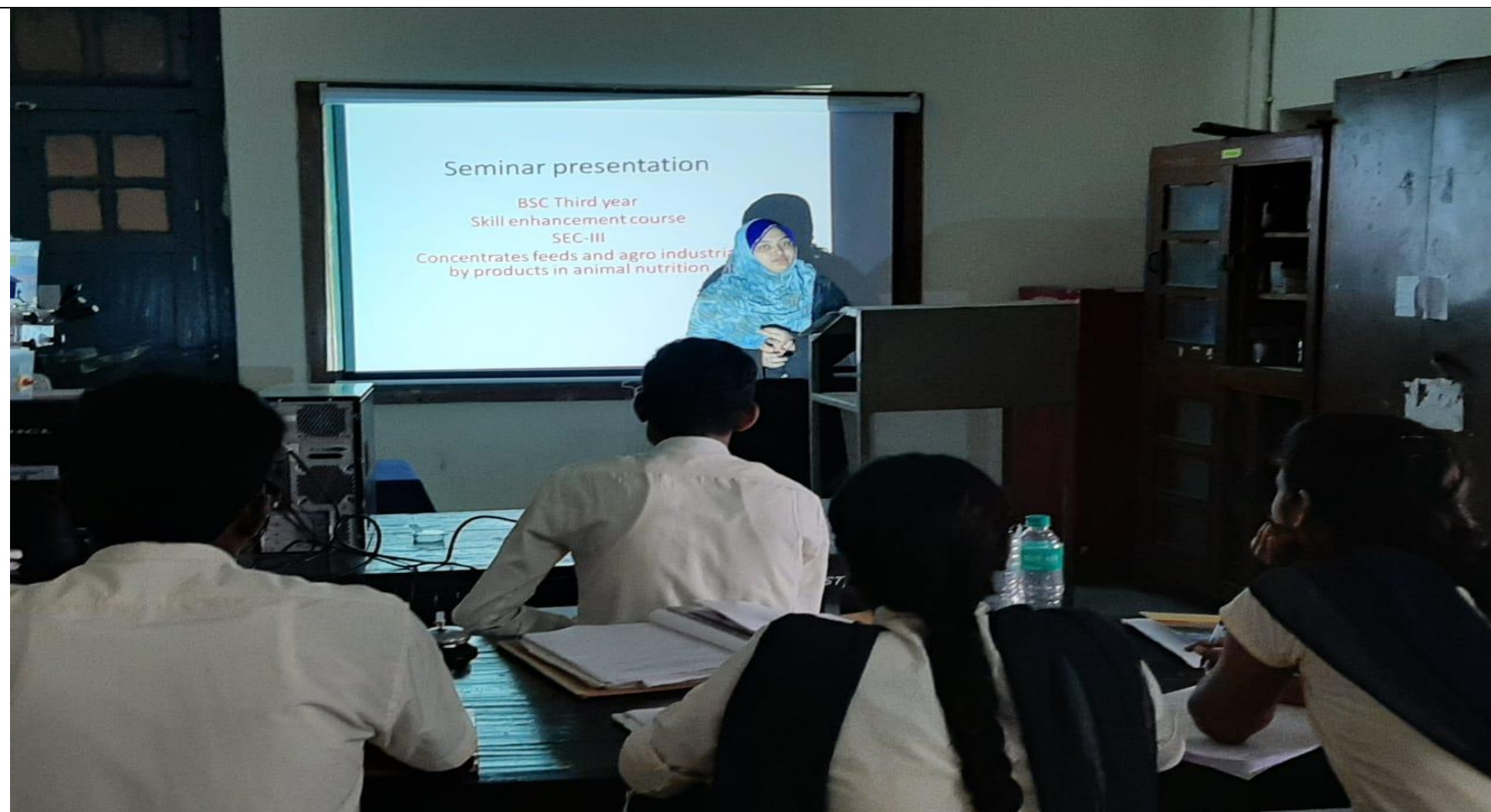
Seminar presented by B.Sc III Year Dairy science students on Skill Enhancement Course Date - 28/08/2019