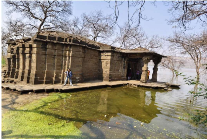
A captivating snapshot taken by someone while exploring the picturesque surroundings of Lonar Lake. The shimmering waters, framed by lush greenery and unique geological formations, created a stunning backdrop for my adventure.